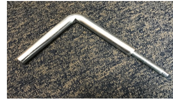
M10 Threaded Key - KEYS/M10