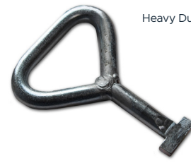
Heavy Duty Key - KEYSHEAVY