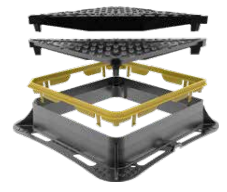
ClickLift shown in yellow for visual purposes